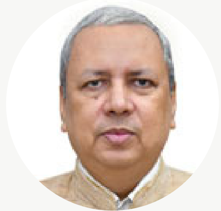
Shri Sanjay Prasad State Election Commissioner, Gujarat