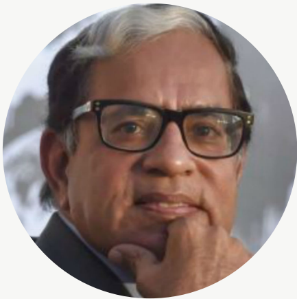
Justice Dr. Arjan Kumar Sikri Former Judge, Supreme Court of India